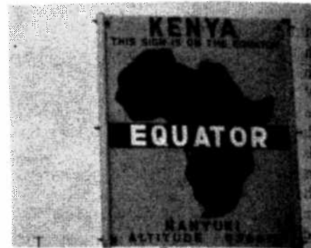
Kenya: the "catalytic converter."

What I learned in Africa unsettled me. I saw the deprivation and oppression of the poor and the politically disfavored in a way not possible in the U.S. In Kenya, my position was not at stake; I was not directly benefitting if the underprivileged had little hope of advancement. I lived with a struggling African family for a month and came to know the hardships that they face. What surprised me was the attitude of the elite; I became friends with a very wealthy businessman and his family and heard them reiterate the same beliefs held by many Americans: the poor are poor because they are lazy, slovenly, uneducated. "Kenya is a land of opportunity," they said, "Those who work receive their just reward." I knew this was not true in the case of many