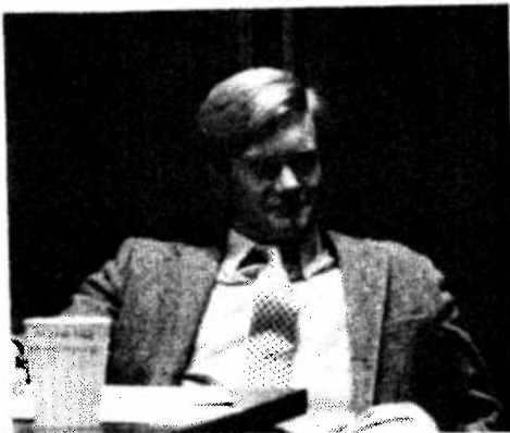
A clean-shaven Christopher Coons.

The point that others ignore is that I was ready to change. Experiences at Amherst my first two years made me skeptical and uncomfortable with Republicanism, enough so that I wanted to see the Third World for myself to get some perspective on my beliefs. Certainly Kenya provided a needed catalyst; I saw there poverty and oppression more naked than any in America, and I studied under a bright and eloquent Marxist professor at the University