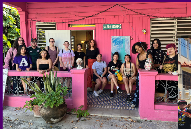
PHOTO TAKEN AT CASA BORIKÉ EN RINCÓN, PUERTO RICO ON MARCH 15, 2023