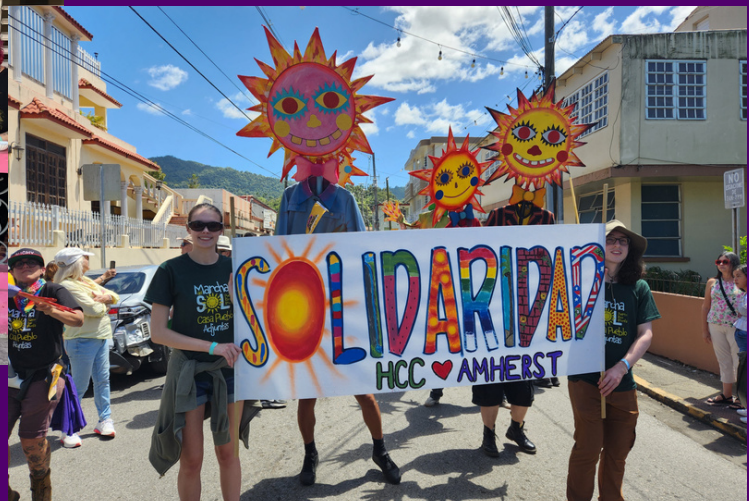
PHOTO TAKEN DURING THE MARCH IN ADJUNTAS, PUERTO RICO ON MARCH 17, 2023