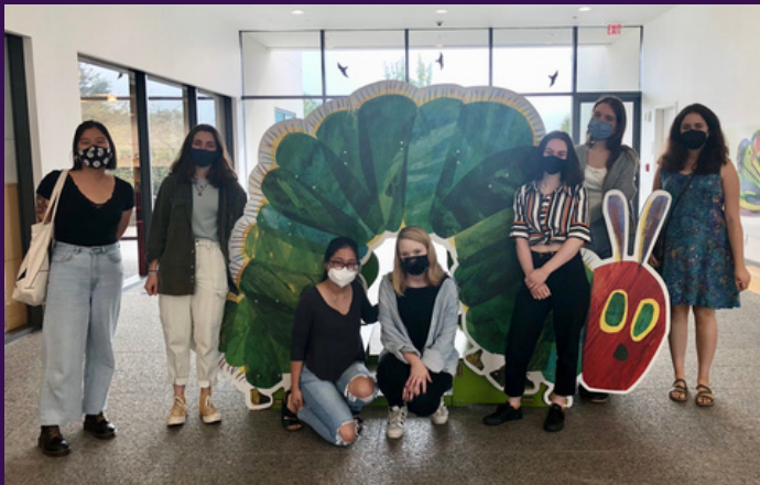
SPAN 451: Translation Roots students' exhibit "Read the World: Picture Books and Translation" on display at The Eric Carle Museum