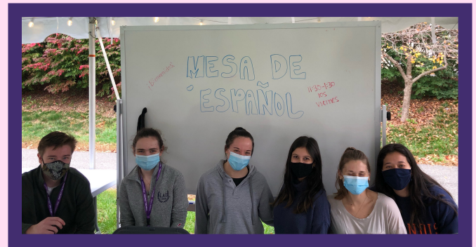
Spanish Table was hosted in Fall 2020 by the senior Spanish majors on Valentine Quad, then virtually hosted by the Spanish TAs in Spring 2021.