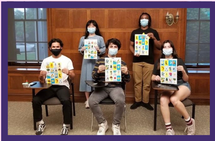
Students attended a Lotería night in May of 2021.